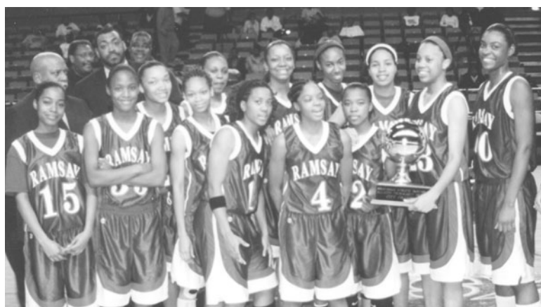
Ramsay Lady Rams hold the Championship trophy.