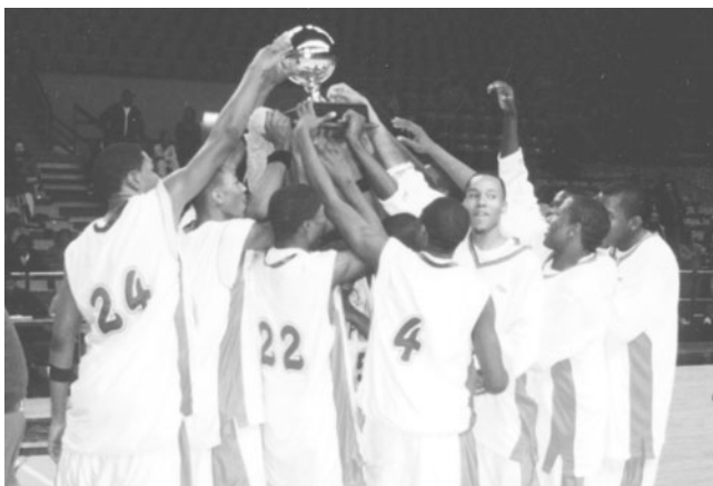
Huffman Vikings celebrate their Championship victory.